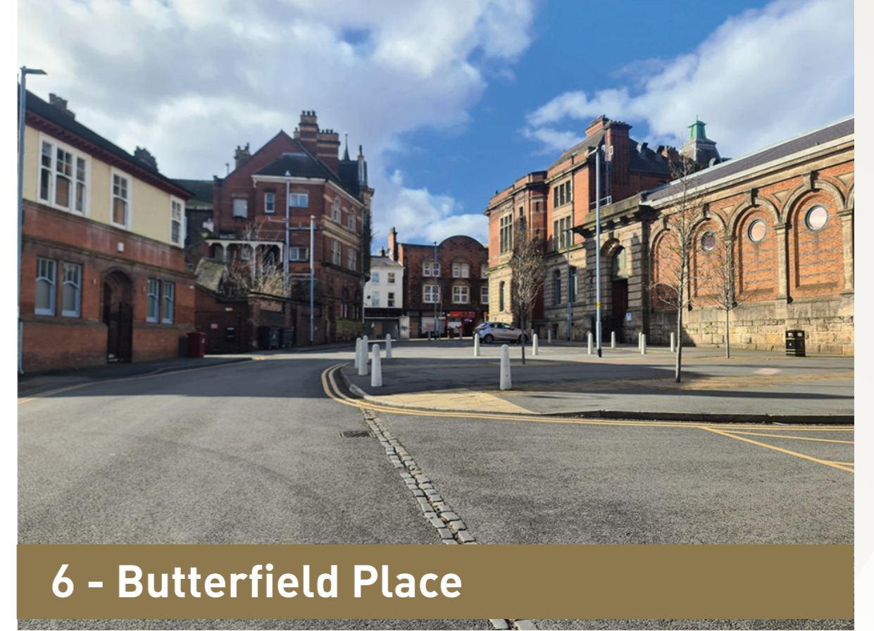
6 - Butterfield Place