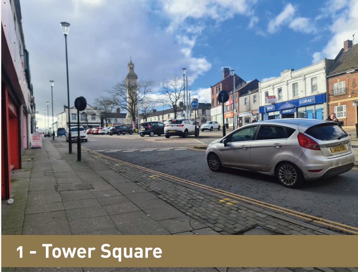
1 - Tower Square