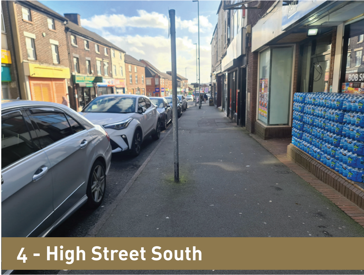
4 - High Street South