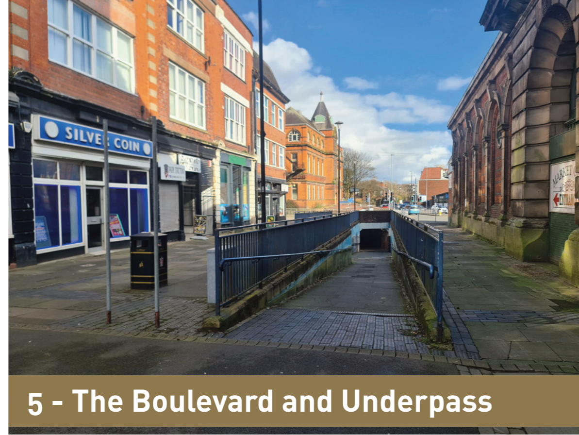
5 - The Boulevard and Underpass