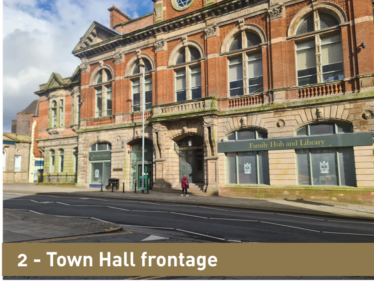
2 - Town Hall frontage