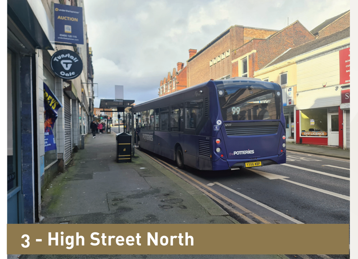
3 - High Street North