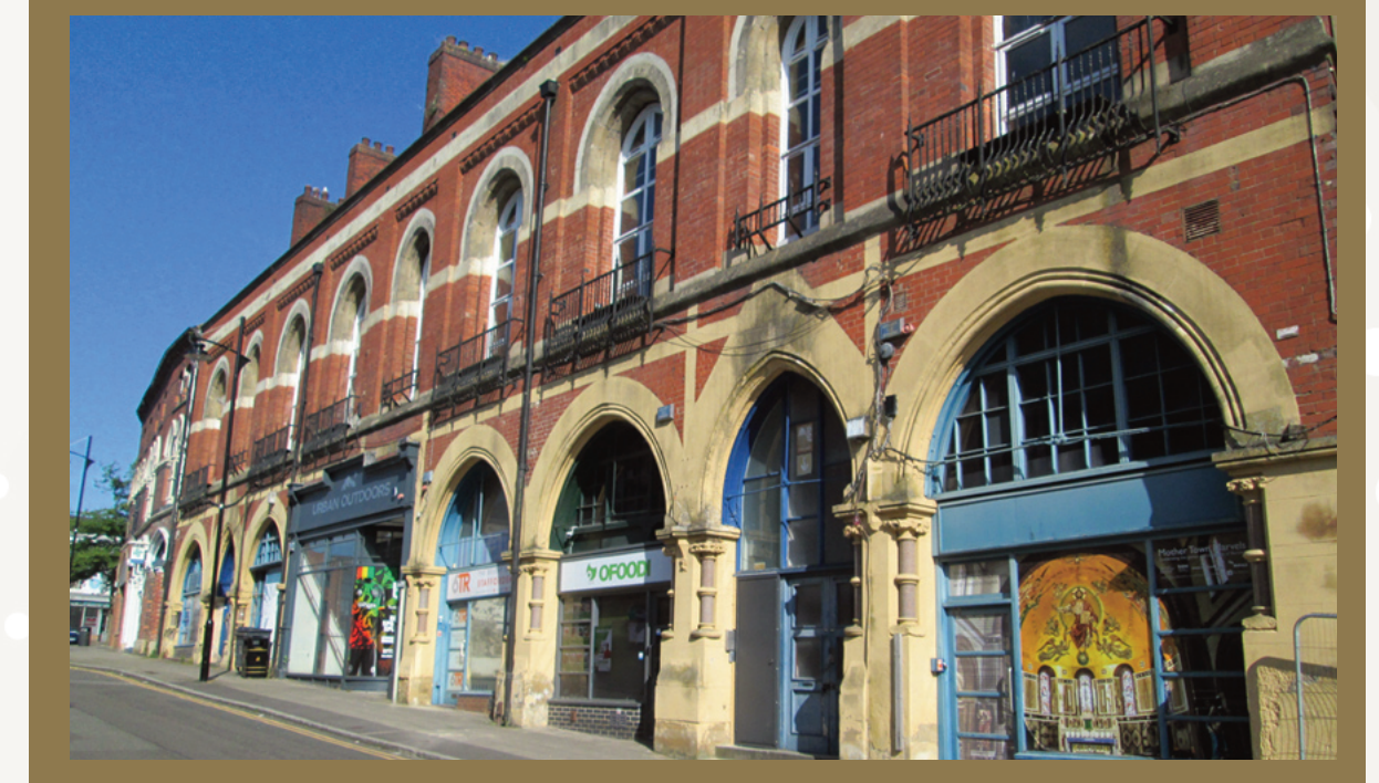
Burslem Market Hall

The Public Realm scheme will support other work in the Town Centre including work to improve the condition of Burslem Market Hall and the Wedgwood Institute to ensure no further decline of the buildings whilst future uses are being investigated.