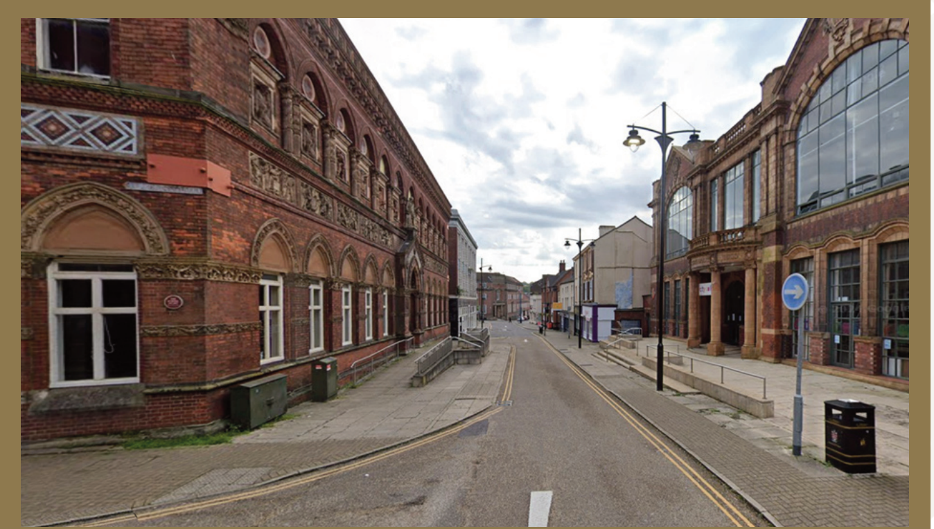
Existing view of Queen Street looking towards the Wedgwood Institute